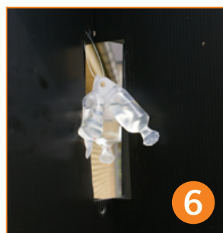
Positioning the pheromone