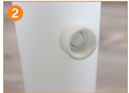
side overflows with cambered stainless-steel sieve