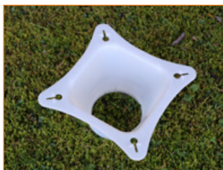
Retrofit accessories: Adapter for Wita®Prall Cross-vane panel Trap