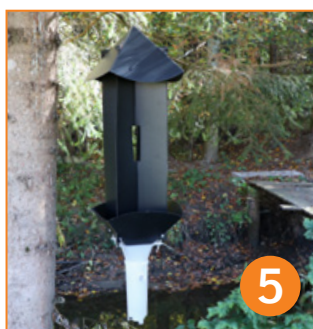
Suspending the trap