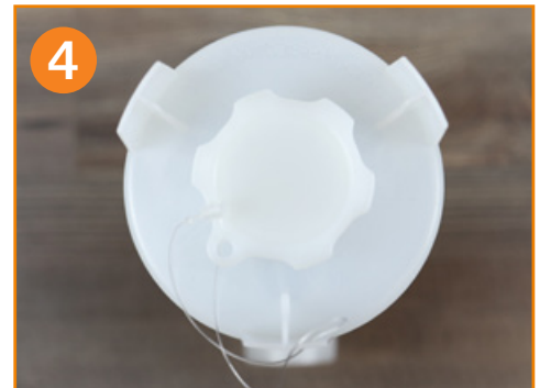
lid for wet trapping

designed for the WitaTrap® Multi Funnel Trap and Wita®Prall Cross- vane panel Trap