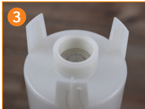
outflow on the bottom with stand