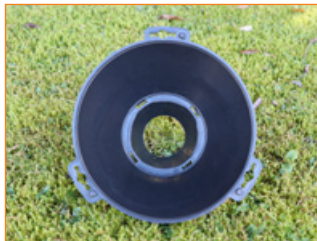
Retrofit accessories: End funnel WitaTrap® Multi Funnel Trap

designed for the WitaTrap® Multi Funnel Trap and Wita®Prall Cross- vane panel Trap