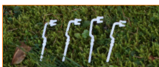
Hooks for Adapter Wita®Prall Cross-vane panel Trap