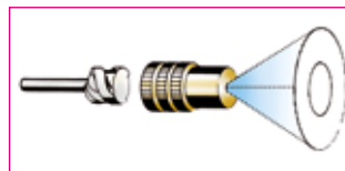
Spray pattern hollow cone nozzle