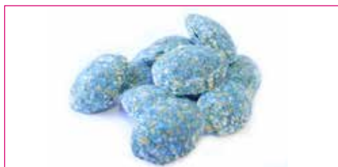
Storm® Ultra Happen