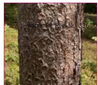
... and becomes transparent after it dries out.

Use pesticides carefully. Before use read the label and product information. This description is designed to give you an overview on various products. Always read the label and product information before using any product. Please comply with the instructions they contain.