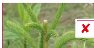
Browsing damage on unprotected spruce

Game feeds all year, particularly in winter, on shoots and buds of plants (= browsing).