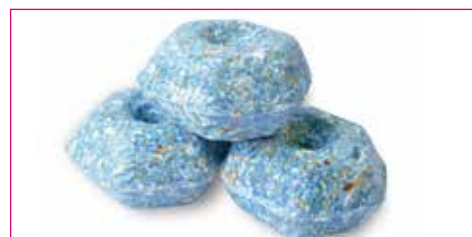
Storm® Ultra Secure