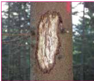
Stripping damage on unprotected spruce

Fallow and sika deer, moufflon and, in particular, red deer may, for various reasons, gnaw and feed on bark (= bark stripping), especially on spruce bark. Bark stripping can occur in winter and in summer. Stripping damage, i.e. the absence of bark on trees, makes the tree prone to fungus attacks, which may cause a massive decrease in value of the wood. Stripping protection is applied to protect the most valuable trees (crop trees) from a diameter of at least 15 cm which are supposed to eventually produce the desired benefits (a maximum of 500 trees per hectare).