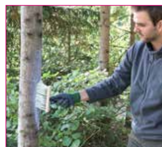
... Wöbra is still gray when applied ...