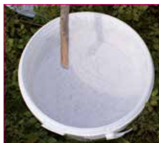
Stir Wöbra well before use ...