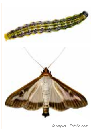
box tree moth ( Cydalima perspectalis )