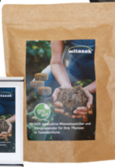
100 tablet large pack.