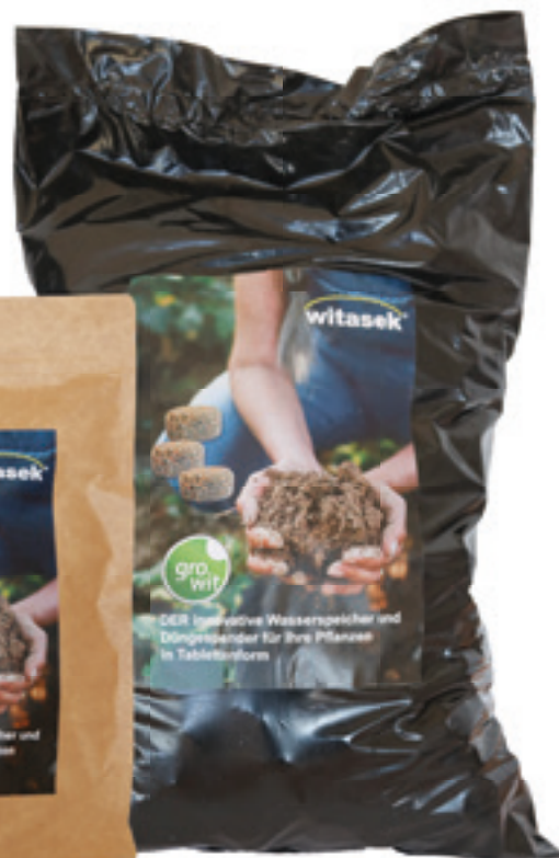
250 tablet sack

Note: store in a dry place and protect against moisture.