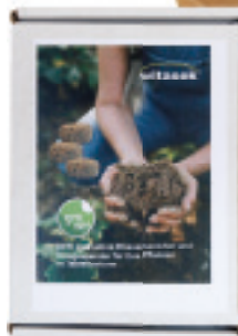
20 tablet small pack